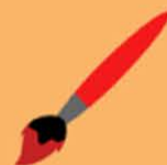
Creative and artistic

Skilled at sports, writing fiction, drawing, or playing music.